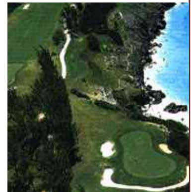
Our Property is surrounded by Port Royal Golf