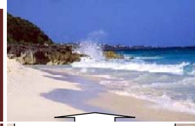
Whale Bay Beach & Fort