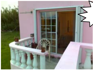
View of Port Royal Golf Course & Pompano Flats